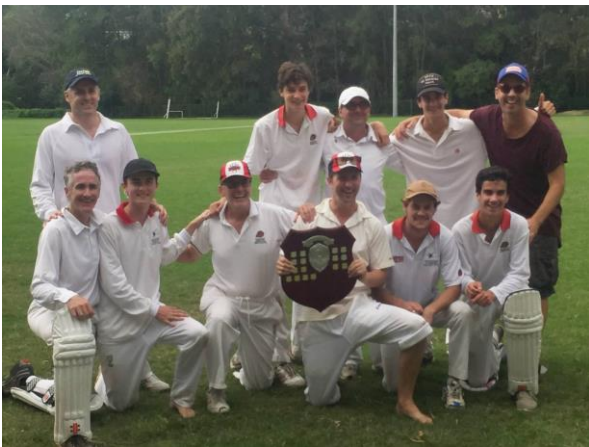
(4 th Grade Black Widows – Grand Final 2017)

Congratulations to the following teams who were the 2016-17 Season Premiers!