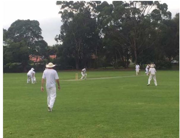
(4 th Grade Huntsmen – Sat 18 th February 2017)