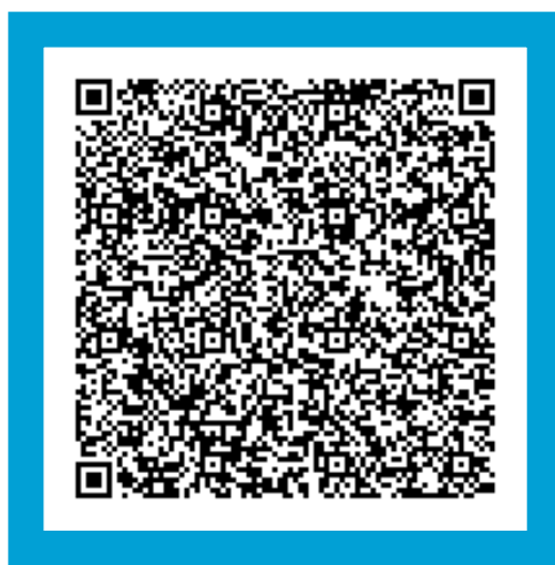
Millers Reserve - MWJCA

We're helping keep our community COVID safe by recording contact details for contact tracing.